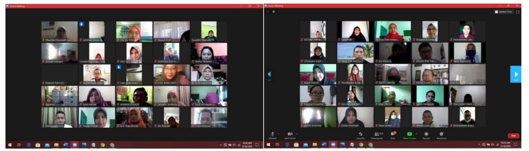
Fig. 2. Documentation of workshop participants.

In the question and answer session for the four materials, there were several questions, including computer specifications for the OBS application and the teacher's video display in the OBS application. This indicates that some teachers are still unfamiliar with making videos using the OBS application. Direct questions are answered by the speaker during the workshop. Other questions are regarding the timing of the google form, limiting the number of questions and participants in the quiziz and the need for registering google classroom by schools.