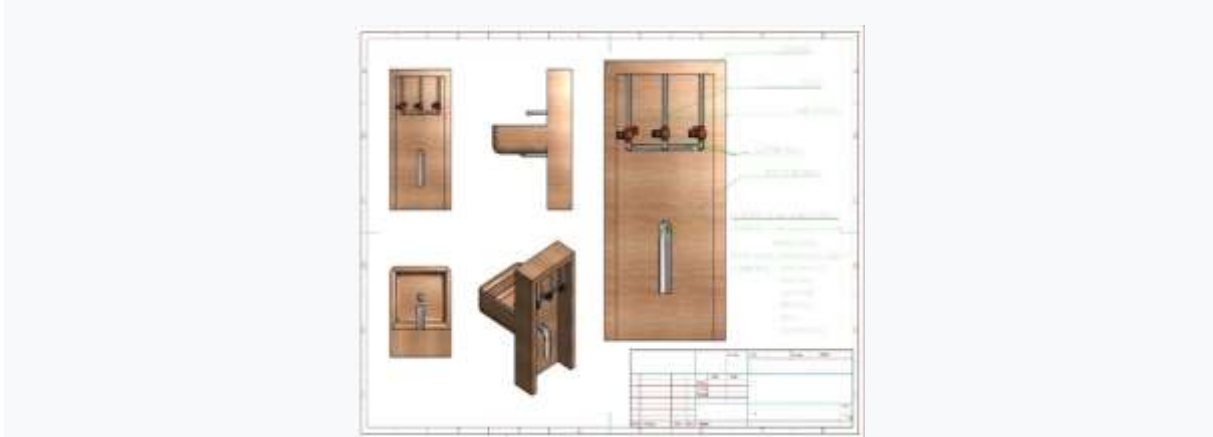
Fig. 1. Design before using the DFMA method.

There are several design improvements of washbasin products with the DFMA method, in order to increase the efficiency of manufacturing and product assembly time. From the design carried out and the changes obtained after using the DFMA method, it can be seen in Figures 1 and 2.