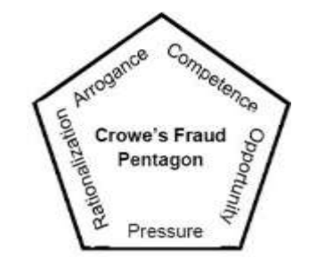
Source : Crowe's fraud pentagon theory (Crowe, 2011) Fig. 2.1 Pentagon fraud