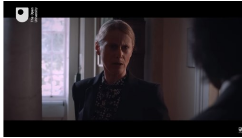
Figure 7. Mrs. Cross meets Ama in the school corridor

At the level of reality, it seems that Mrs. Cross was rushing out of the room and carrying books. But she suddenly stopped when Ama and Kerry came out of the shower. As always, Mrs. Cross always focused on Ama. She gave an intimidating stare like an attitude of disapproval of someone. This is signed by the look in Mrs. Cross's eyes and the sharp slit on her forehead. This expression was expressed by Mrs. Cross when she saw Ama's appearance. In this scene, Ama lets her hair loose just like the natural hairstyle of a black person. Ama stopped her step when she realized Mrs. Cross was there. But this time the expression of fear and anxiety was no longer indicated by her. She looked at Mrs. Cross very normally. Even a little challenging.