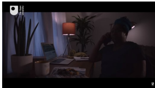
Figure 9. Mrs. Cross speaking to Issa and Ajay through phone

At the level of reality, a journalist named Issa from the Herald newspaper contacted Thema through Ajay's mobile phone, one of the teachers at the Ama school. The second reason for contacting Thema is that Issa wants to help out with Ama's problem by writing a policy news item that invites elements of racism at the Ama school. However, Thema rejected Issa's offer because she did not want Ama to suffer a negative impact if her attempts were unsuccessful. In this scene, Issa and Ajay have a set take in The Herald Newspaper office. Spotted by a company name on the wall of the room. Thema is in her workroom at her house. Seen by a laptop, papers, a desk lamp, a standing light, and a sofa. The polishing of the makeup used in this scene looks natural. Their clothes looked comfortable. In expressive terms, Thema shows little anxiety and confusion. Seen from her facial expressions and the slightly quivering tone of Thema.