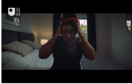
Figure 1. The role of Thema