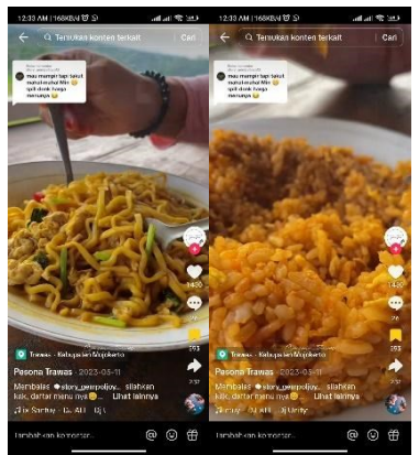
Figure 5. TikTok account @pesona_trawas

@pesona_trawas shoppers and accommodate the menus through the order displayed by the @pesona_trawas. Some of the menus ordered by @pesona_trawas include original fried noodles and original fried rice for the snacks ordered, chocolate bananas and lemongrass drinks shown in pictures 15, 16, 17, and 18. With the help of these purchases, @pesona_trawas may be able to provide feedback to viewers who view the content on TikTok Social Media. For example, a video showing @pesona_trawas buying some menu items from Kedungudi Sky Park Hill can encourage customers to visit Kedungudi Sky Park Hill.