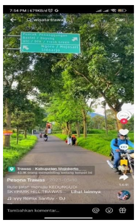
Figure 3. TikTok account @pesona_trawas

The video shows the travel route to Kedungudi Sky Park Hill. @pesona_trawas explained that the travel route to the location of Kedungudi Sky Park Hill is quite steep because of its uneven and steep terrain. The beginning of the journey is shown to come from the Tamiajeng intersection, followed by turning left to take the Mojopahit valley path. After turning left, we will find the symbiosis cofee café, if you turn left again we will go to Lesehan cs dewi, if you take the right direction, we will find Estusae coffee. Continue straight along the path without changing direction. Currently, entering the Jolotundo area, passing through Lesehan Brugan and stall mas doyok. @pesona_trawas advised the audience to prepare for all possibilities that will occur when traveling to Kedungudi Sky Park Hill because of the uneven and dangerous terrain. It is important to use the appropriate vehicle when starting the journey. When passing through the jolotundo road, motorists will be presented with a view that pampers the eyes, the scenery around the jolotundo path displays a beautiful scenery because the surroundings of the jolotundo path are surrounded by forests that are still beautifully preserved, especially when passed in the afternoon as done by @pesona-trawas. The location of Kedungudi Sky Park Hill is on the left, reduce the speed of turning on the turn signal and we have reached the destination.