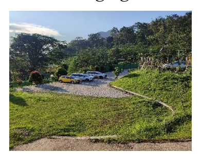
Figure 12.

In pictures 15, 16 is one of the facilities in Kedungudi Sky Park Hill. The location of the stop for motor vehicles and cars. When there is no vehicle stop at a tourist attraction, it feels less afdol. There may not even be a tourist attraction that does not have a vehicle storage area, the storage place can be one of the satisfaction in itself for visitors, they are not worried about the vehicle they use, because it is safe in the storage area. Because the majority of Indonesia's population is Muslim, there is a muholah location to worship for tourists who identify themselves as Muslims. As a result, many tourist locations in Indonesia provide prayer room facilities.