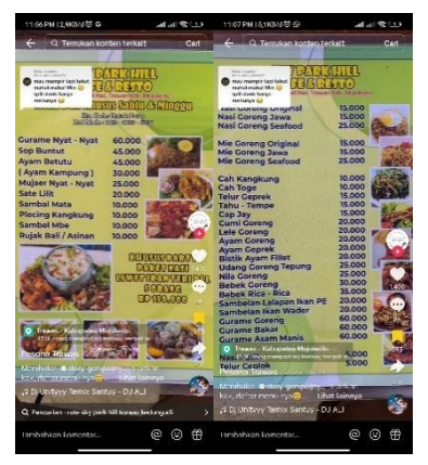
Figures 4. TikTok account @pesona_trawas

Shown in the picture above, Kedungudi Sky Park Hill has a very fariative menu, ranging from snacks to heavy mananah that is quite shaky. For the drink menu shown in the picture below, the menu presented is quite contemporary ranging from french fries, grilled sausages, chocolate pisasng nuggets, seafood fried rice, seafood fried noodles, chicken filet steak, Balinese coffee, lemon tea, and others.